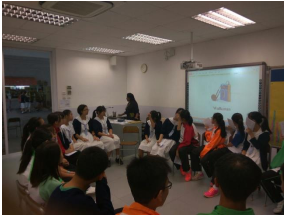
Fun Games for S.3

NP2C School Reporter – Remembering the 1980s English Week was back! It was held with great success in October and November.